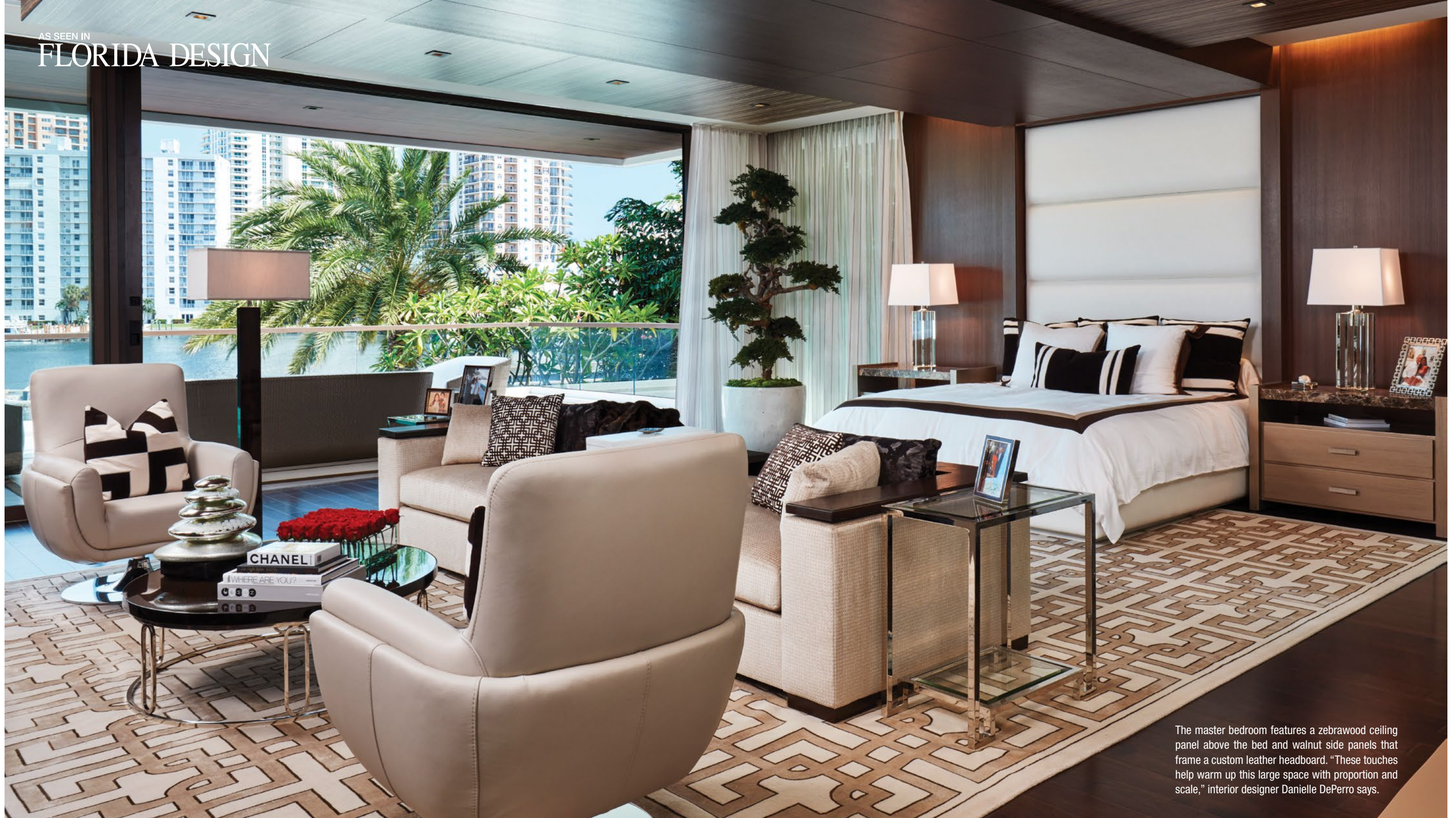
The master bedroom features a zebrawood ceiling panel above the bed and walnut side panels that frame a custom leather headboard. "These touches help warm up this large space with proportion and scale," interior designer Danielle DePerro says.

might play," the designer says. The floating walnut soffit above had to be designed and planned far in advance so that supports could be placed during initial construction. Here too, DePerro added an elegant touch with LED lighting around the inside and outside of the woodwork. "We really pushed the envelope with our use of lighting in the home," she says. Beyond, kitchen cabinetry from Poggenpohl lends a striking impression in dark wood with clean lines.