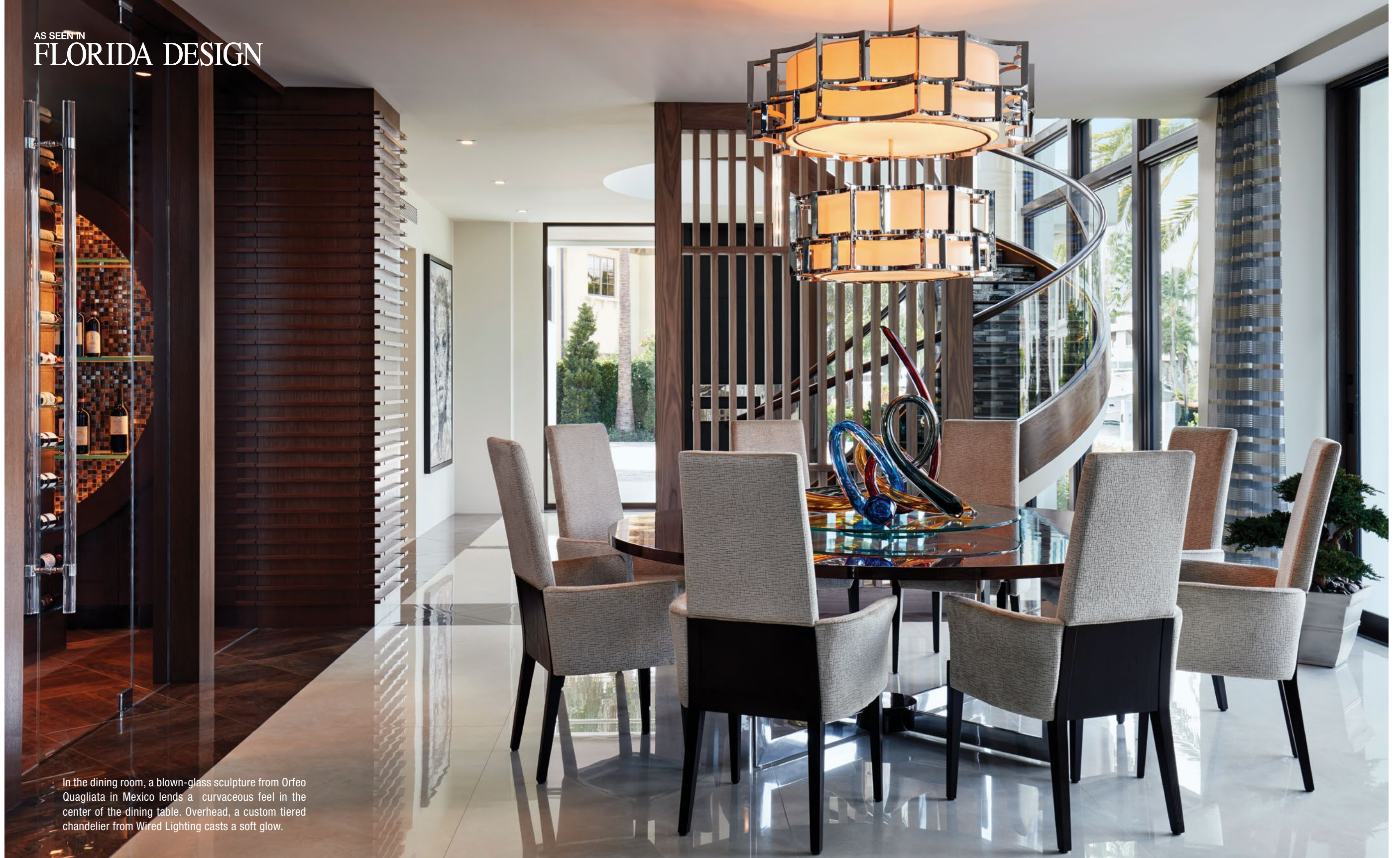
In the dining room, a blown-glass sculpture from Orfeo Quagliata in Mexico lends a curvaceous feel in the center of the dining table. Overhead, a custom tiered chandelier from Wired Lighting casts a soft glow.

Upon entering through a large mahogany front door, the home's splendor is evident from its dramatic, three-story custom stairway designed by DePerro and constructed by builder Bill Bentz. "The stairway was designed with special steel and high-strength concrete to form the thinnest profile possible," Bentz says. "To illuminate the treads and risers, an LED strip was effectively concealed," he says.